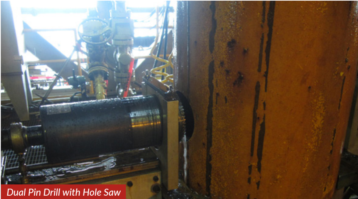
Dual Pin Drill with Hole Saw

Mactech had previously completed smaller slot recovery work scopes for Enven in a safe and cost-effective manner.