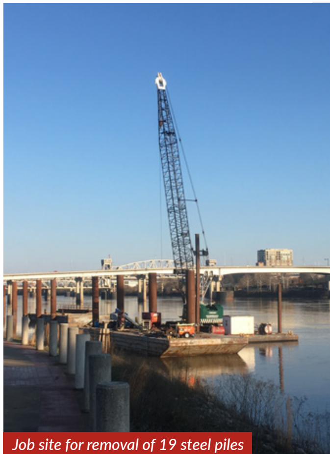
Job site for removal of 19 steel piles